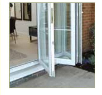
Extensive openings up to 6.5 metres wide maximises ventilation and environment