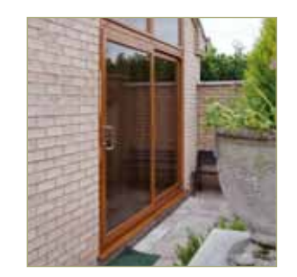
Patio doors are perfect for leading into your garden space

Available in a range of colours such as classic cream or traditional timber appearance, you can select a different interior colour to blend with your interior décor.