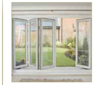
Our bi-fold doors are manufactured to achieve attractive looks and maximum glass area