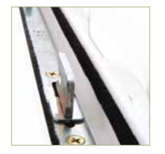
Featuring the latest high security locking systems