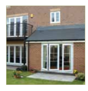
door blends confidently into its environment