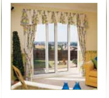
Patio doors increase natural light into