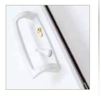
Available in a range of stylish handle options