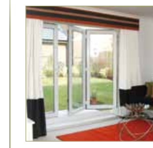
A choice of fold options and opening styles means your door can be