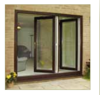
Stunning designs and the feeling of more space will enhance your lifestyle and improve the value of your home

With a choice of contemporary colours and styles, you can create a look that is perfect for your home. Whether you want to match your existing décor, or make a stylish contrast, our doors offer the ultimate walkway from indoor to outdoor living.